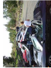
Wine Tasting Line-up