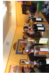
Wine tasting fun!!