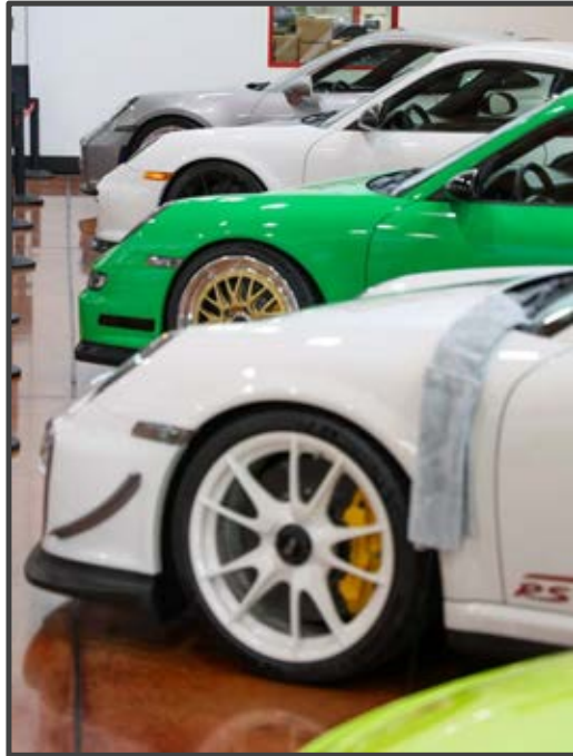
The inside display was loaded with GT3's, GT3RS's, a Carrera GT, and other Super Porsches!