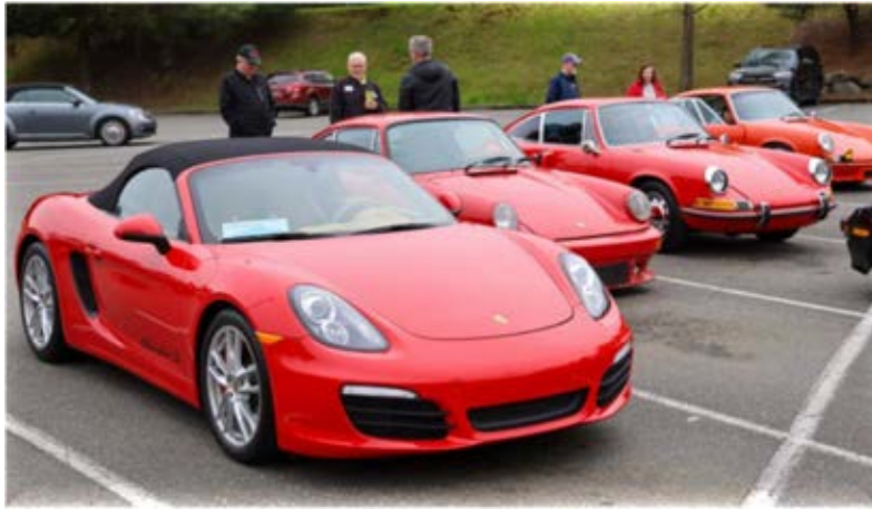
Just a few of the cars lined up at Barnes & Noble