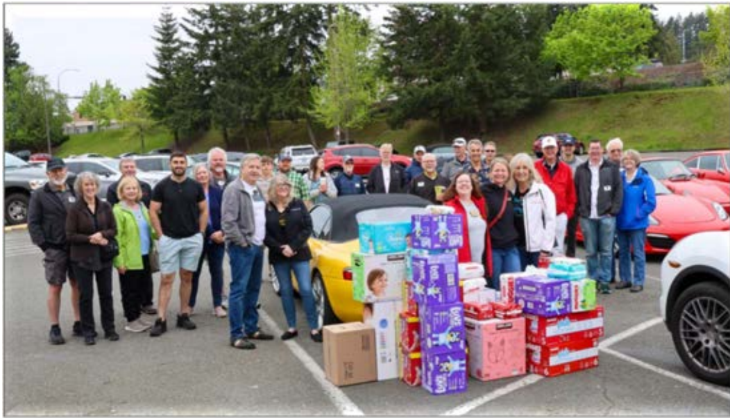
Rally participants along with our donation to the Bremerton Foodline.