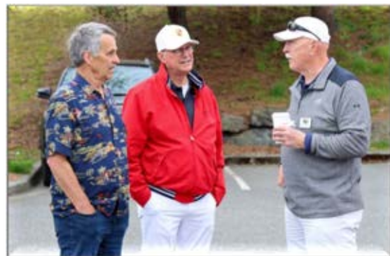
And Discussing Strategy!