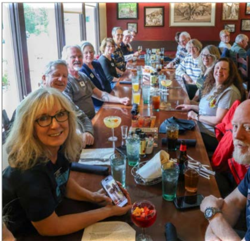
One of the three tables we had at the Olive Garden.