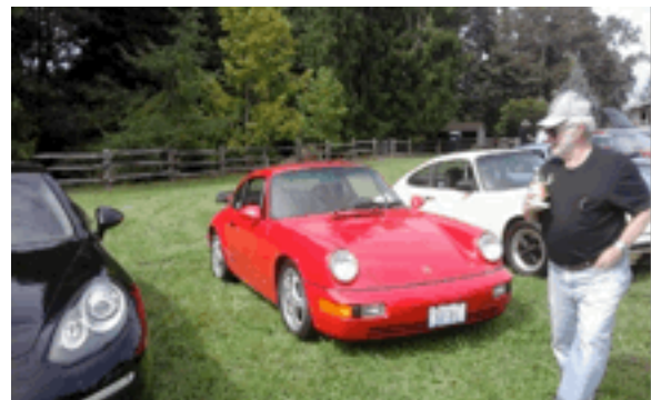
Corby Somerville surveys the beautiful Porsches on display (right).