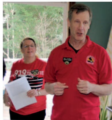
Hey! That's us!!! Who took that picture???