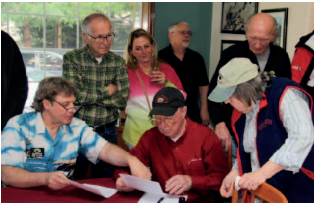
How many people does it take to read the social calendar?