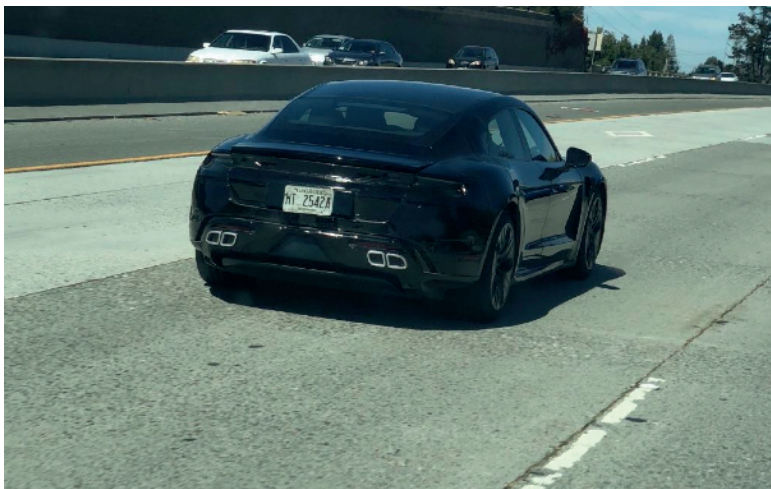
A camouflaged Porsche Taycan test mule spotted in Mountain View, CA.

Perhaps they are headed to Washington...? Watch out!