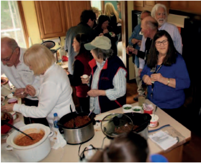
It's chili tasting time which means mob scene in the kitchen.