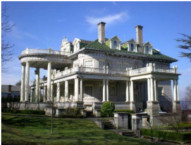
William Ross Rust House on I St. in Tacoma