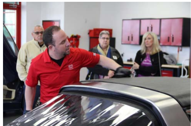
Vinyl top care demonstration