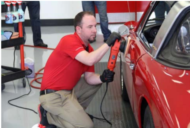
Buffer Demonstration of the BOSS G15 buffer