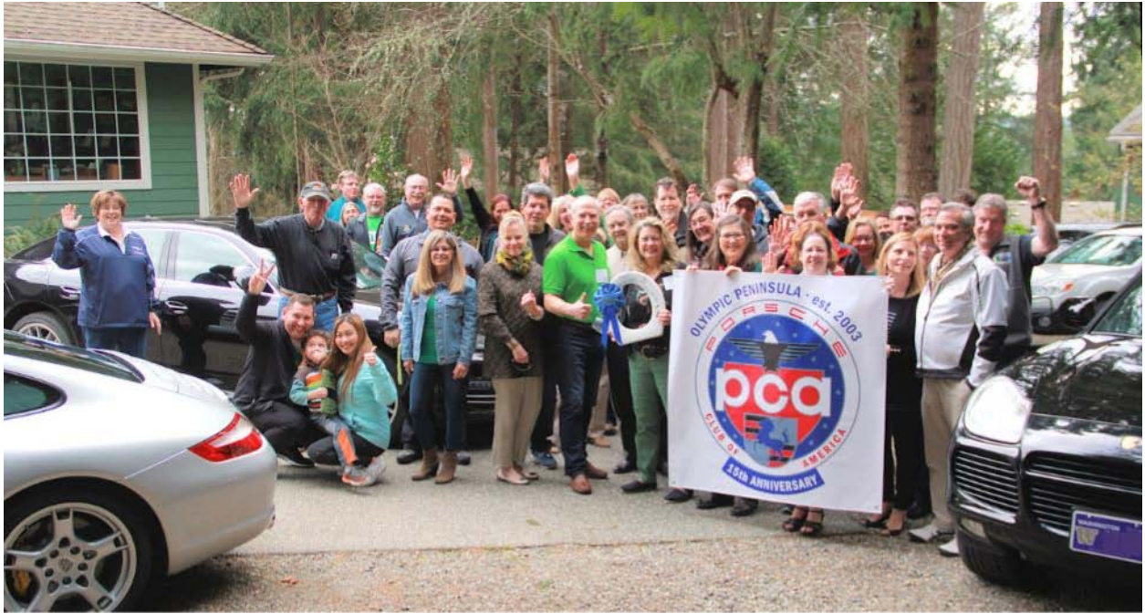
The cook-off attendees with our region's 15 th Anniversary banner