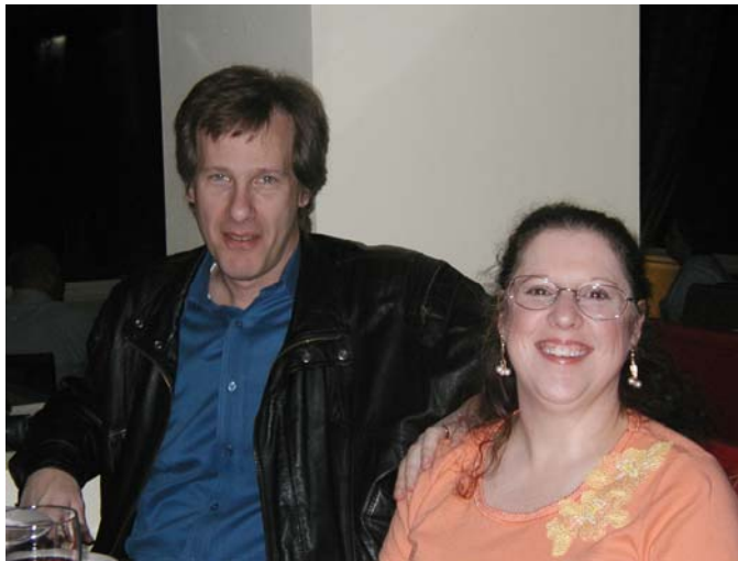
Hey, wait a minute...

It is a very pretty place and indeed the glass sculptures were impressive and beautiful. We wound our way back to Nemo's where the majority of the crowd that had RSVP'ed was already waiting. There were twenty-four of us all together. We ate, drank, and were pretty merry (as usual). The food was very good. And Nemo's has a very good selection of wines