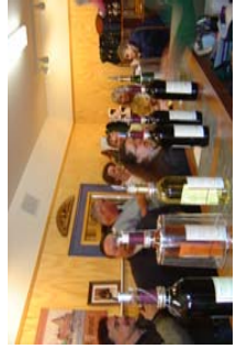
Wine tasting fun!!