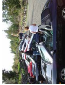
Wine Tasting Line-up